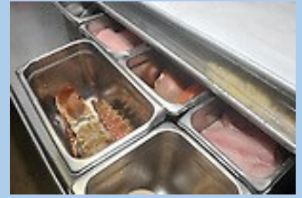
More fresh seafood that does not need to be plastic wrapped every time ONE is sold