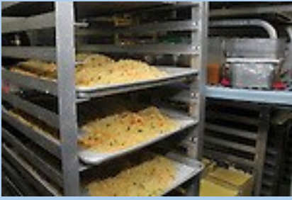
Note the exposed rice and fish right next to each other