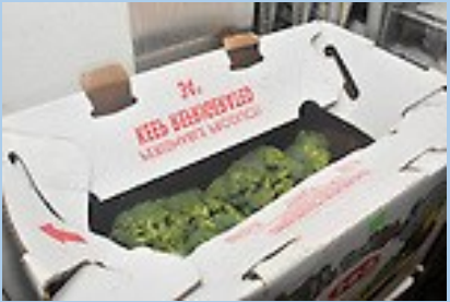
Fresh Vegies exposed in the same walk-in