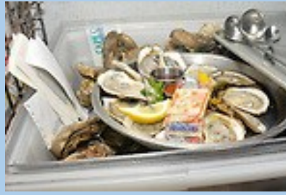
They shuck oysters right in the walk-in