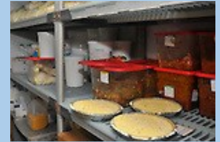
Fresh made pies cooling in the same walk-in with seafood